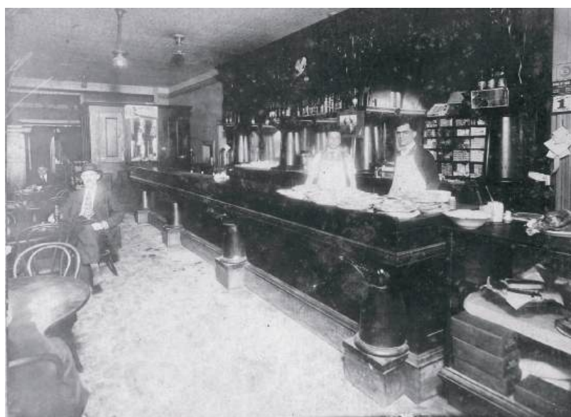
Casimiro Jr., on the right, serving Cuban Sandwiches and other specialties enjoyed by the local immigrants in the Café in 1919.

A trio of grilled skewers featuring fine cuts of marinated chicken, pork, Spanish chorizo and caramelized onions. A staple at bars and restaurants in Spain, perfect for sharing. 12