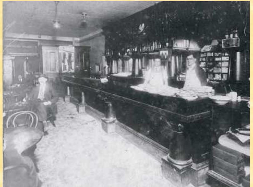
Casimiro Jr., on the right, serving Cuban Sandwiches and other specialties enjoyed by the local immigrants in the Café in 1919.

A trio of grilled skewers featuring fine cuts of marinated chicken, pork, Spanish chorizo and caramelized onions. A staple at bars and restaurants in Spain, perfect for sharing. 10