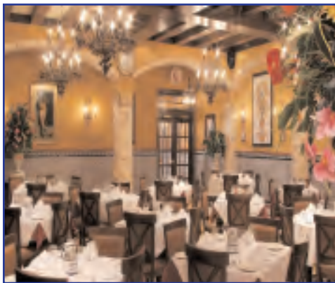
Columbia Ybor City.