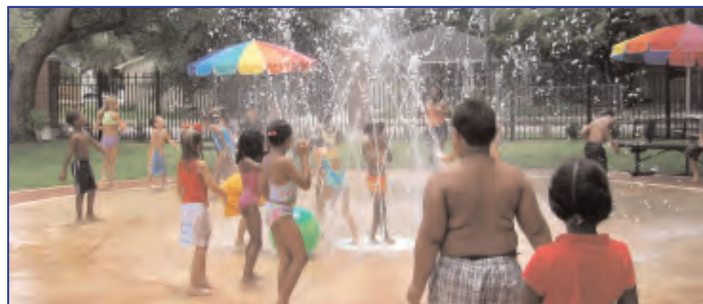
Children enjoying the water fountain.