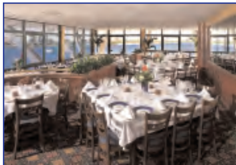
Columbia at the Pier in downtown St. Petersburg.

We also have a variety of one-of-a-kind gift ideas in our Columbia Restaurant Gift Shops, and on our website at www.columbiarestaurant.com