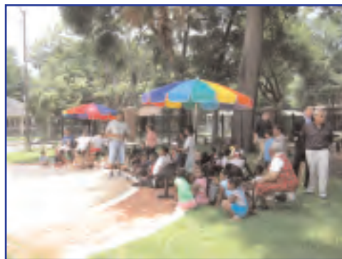
Waiting for the fun to begin.....