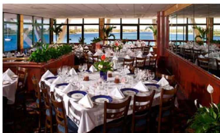
Waterfront event space in downtown St. Petersburg

We look forward to making your event jolly!