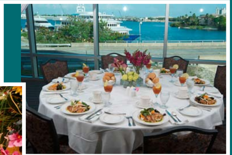
Waterfront event space on the Riverwalk, Tampa