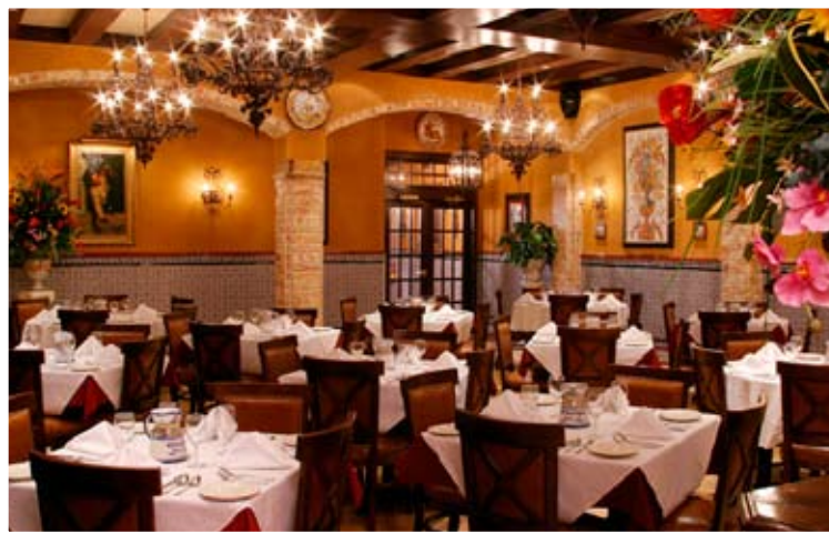
1 of 15 different dining rooms at Columbia Ybor City